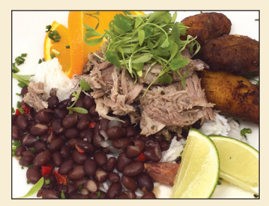
Braised mojo pork