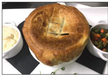
Steak & mushroom pot pie