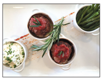
Veal meatloaf with mashed potatoes & green beans