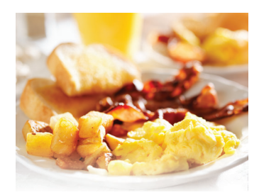
Scrambled Eggs Crisp Bacon Bradley's Country Sausage Links Fresh Cut Seasonal Fruit Biscuits Warm Grits Coffee Assorted Juice

The buffet will be presented on Tuesdays, Wednesdays and Thursdays during legislative session; reservations are not required. In addition to our breakfast buffet, the Morning Eye Opener has been moved permanently to The Lounge. Enjoy complimentary "to-go" coffee, assorted breakfast bars and whole fruit weekdays from 7-10 a.m. We proudly serve Lucky Goat Coffee, "Roasting the World's Best Coffee in the Capital City."