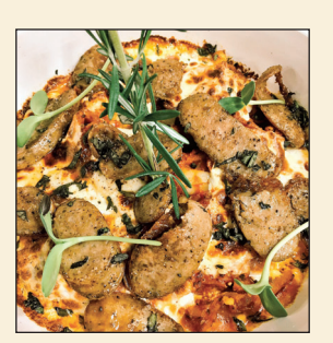
Baked Ziti with Italian Sausage