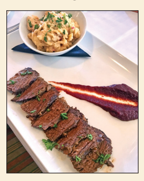
BBQ Brisket with Mac & Cheese