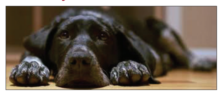
Saturday, April 21 | 11:30 a.m. - 3 p.m. | Governors Club Patio & Adams Street

Bring your beloved canine to the CLUB this spring for our CLUB Canine Showcase. We'll be taking over Adams Street for a day of fun with our loyal furry friends. There will be plenty of activities for dogs and their owners. Florida Pets Alive Inc. will feature wonderful rescue dogs that are in need of forever homes. This event will be held on the same day as Art in the Park, so mark your calendar now and make it a full day downtown with your family, friends and canine companions!