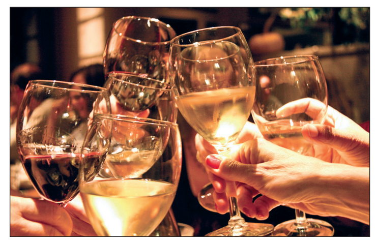
Thursday, March 22 | Spotlight on Sauvignon Blanc 6:30 p.m. | $30++