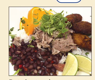
Braised mojo pork