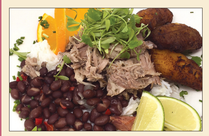
Braised mojo pork