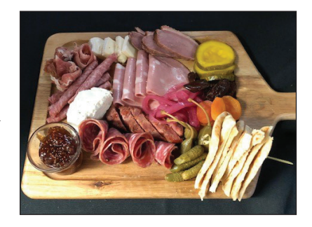
Full Charcutier Board Only $15.50

Gather the gang and kick-start vour weekend in the Lounge with Martinis & Munchies. Not only will we offer these wonderful martinis. but we always serve five-dollar Tito's and Buffalo Trace Bourbon cocktails.