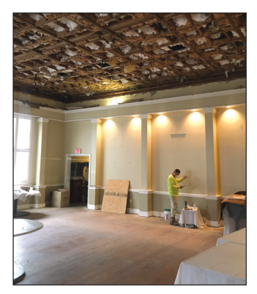
Main Dining Room