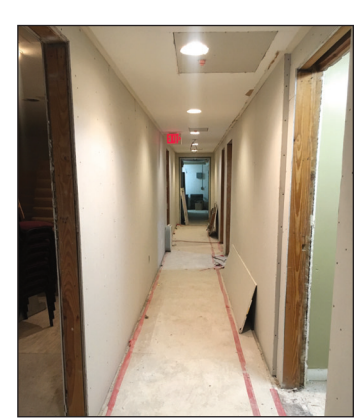
3rd Floor Hallway