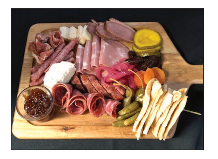
Full Charcutier Board Only $15.50

Gather the gang and kick-start your weekend in the Lounge with Martinis & Munchies. Not only will we offer these wonderful martinis, but we always serve five-dollar Tito's and Buffalo Trace Bourbon cocktails.