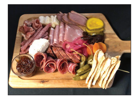
Full Charcutier Board Only $15.50

Gather the gang and kick-start your weekend in the Lounge with Martinis & Munchies. Not only will we offer these wonderful martinis, but we always serve five-dollar single pour Tito's and Buffalo Trace