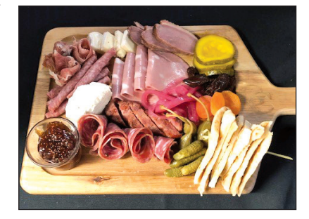
Full Charcuterie Board Only $15.50

Gather the gang and kickstart your weekend in the Lounge with Martinis & Munchies. Not only will we offer these wonderful martinis, but we always serve five-dollar single pour Tito's and Buffalo Trace Bourbon cocktails. Add to the fun that our full Lounge menu will be offered at half price!