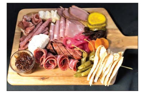
Full board $32 Half board $17

Order a beautiful array of cheeses, Italian meats, sausages, dried fruits, olives, pickled vegetables & grilled flatbread from the talented chefs at your CLUB . Our boards are carefully crafted with the finest ingredients available. Add a bottle of wine, cold brews or your favorite cocktails to your order.