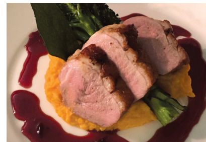
Pan Seared Pekin Duck Breast