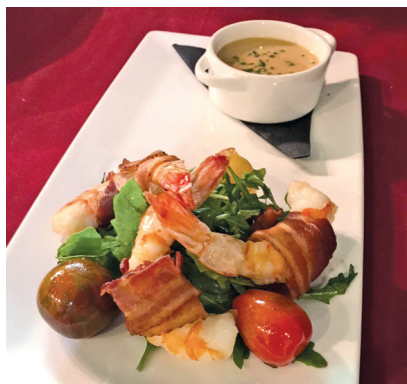
Soup & Salad, Bacon Wrapped Shrimp Salad & Crawfish Bisque

amuse of Panacea Pearl oysters served with a champagne mignonette and masago seaweed salad. The first course was a bacon wrapped Gulf shrimp on petite arugula salad and accompanied with a small cup of crawfish bisque. The second course offered a succulent pan seared Pekin duck breast served with sage infused sweet potato mash, grilled broccolini and a blackberry port wine gastrique. The third course presented a porcini dusted pave' de saumon with celeriac puree, crispy brussels sprouts and sauce beurre