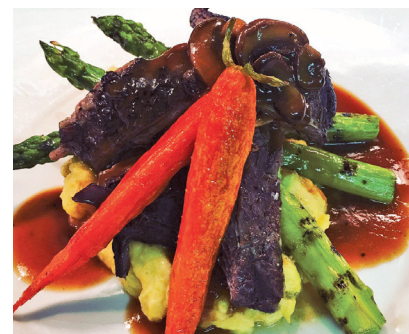
Braised Venison Short Ribs