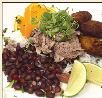
Braised mojo pork