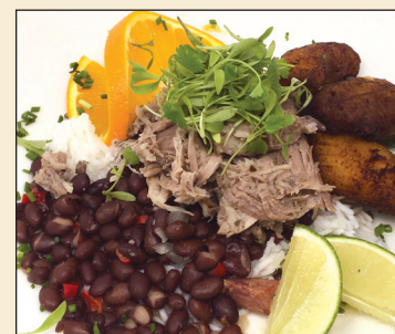
Braised mojo pork