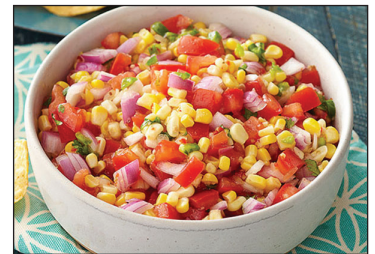
Roasted Corn and Bacon Salsa