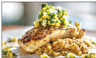
Pan-Seared Florida Grouper

Bring your cleaned wild game or fresh catch to the CLUB and let us bake, broil, grill, poach or sizzle-up the fruits of your labor. For only $12++ per person, enjoy your protein served with fresh vegetables and a choice of rice or potato. Better yet, bring both and we'll dazzle your senses with an amazing surf and turf. Call ahead and let us know what you are bringing and how you would like it prepared. Bon appétit!