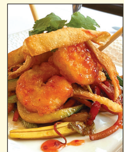
Crispy Tempura Shrimp