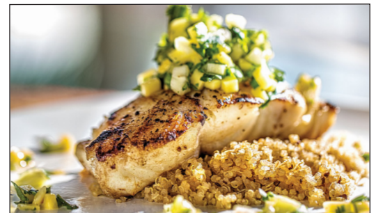
Pan-Seared Florida Grouper

Bring your cleaned wild game or fresh catch to the CLUB and let us bake, broil, grill, poach or sizzle-up the fruits of your labor. For only $12++ per person, enjoy your protein served with fresh vegetables and a choice of rice or potato. Better yet, bring both and we'll dazzle your senses with an amazing surf and turf. Call ahead and let us know what you are bringing and how you would like it prepared.