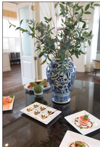
Courtney Wahl Photography