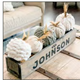
16" Centerpiece Box

include CLUB Sommelier selected red and white wines for inspiration, and Chef will present a delectable charcuterie for snacking. Reserve by Tuesday, October 11. Call 850-224-0650 for reservations; confirmed reservations will be billed.