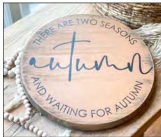
12" Round Sign/Lazy Susan

We have partnered with AR WORKSHOP TALLAHASSEE to offer you a DIY evening with three crafty options. Choose from the three projects shown and personalize them in any way you please. Of course, the evening will