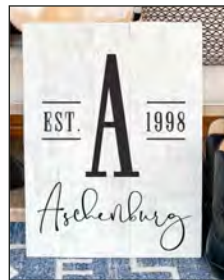
12x16" Solid Plank Tray