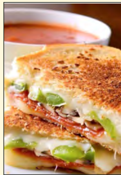
Soup & Sandwich

Smoked Gouda grits with tasso-sweet pepper cream sauce