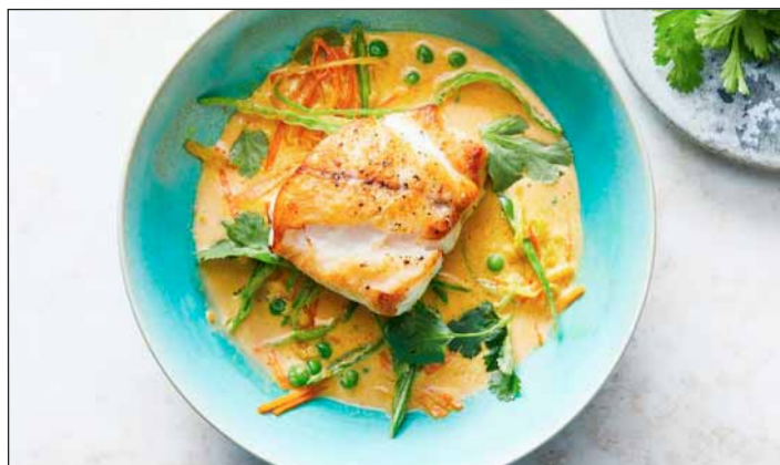
Florida Grouper with Ginger & Coconut Curry

Bring your cleaned wild game or fresh catch to the CLUB and let us bake, broil, grill, poach or sizzle-up the fruits of your labor. For only $12++ per person, enjoy your protein served with fresh vegetables and a choice of rice or potato. Better yet, bring both and we'll dazzle your senses with an amazing surf and turf. Call the concierge ahead of your visit and let us know what you are bringing and how you would like it prepared.